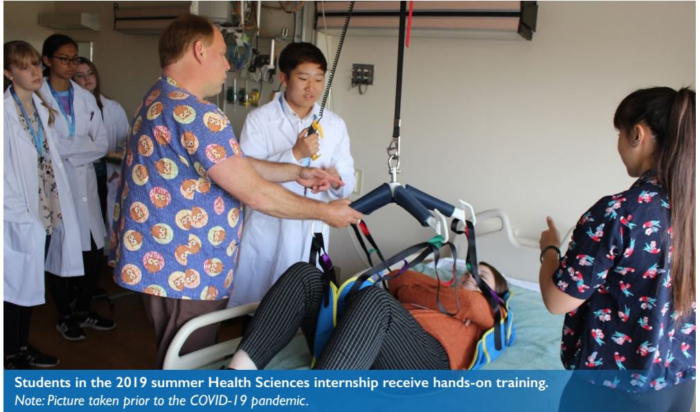
Students in the 2019 summer Health Sciences internship receive hands-on training. Note: Picture taken prior to the COVID-19 pandemic.

An array of Health Sciences courses offered at Gig Harbor High School and Peninsula High School provide pathways for students to research and solve problems, explore career paths, and engage with important healthcare topics.