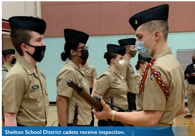
Shelton School District cadets receive inspection.