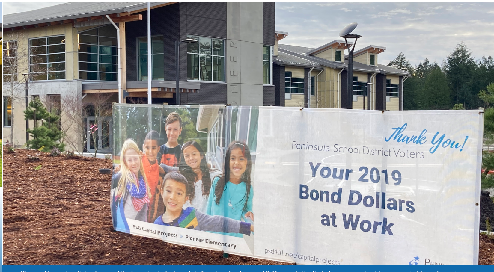
Pioneer Elementary School opened its doors to students and staff on Tuesday, January 19. Pioneer is the first elementary school to open out of four elementary construction projects, and six projects overall, funded by the 2019 capital projects bond.