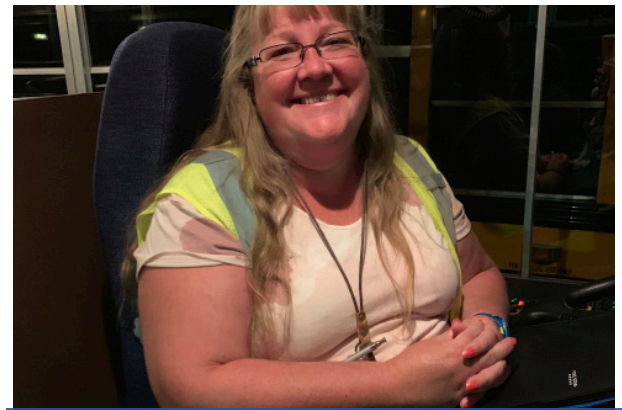
Purdy Elementary students excitedly greet the 2019 PHS graduates!