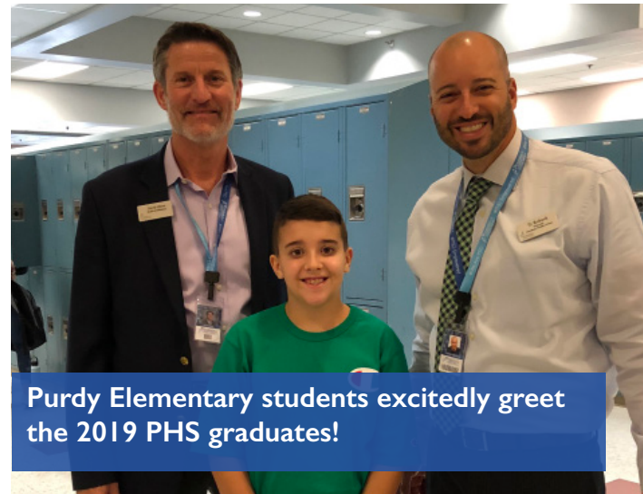
Purdy Elementary students excitedly greet the 2019 PHS graduates!